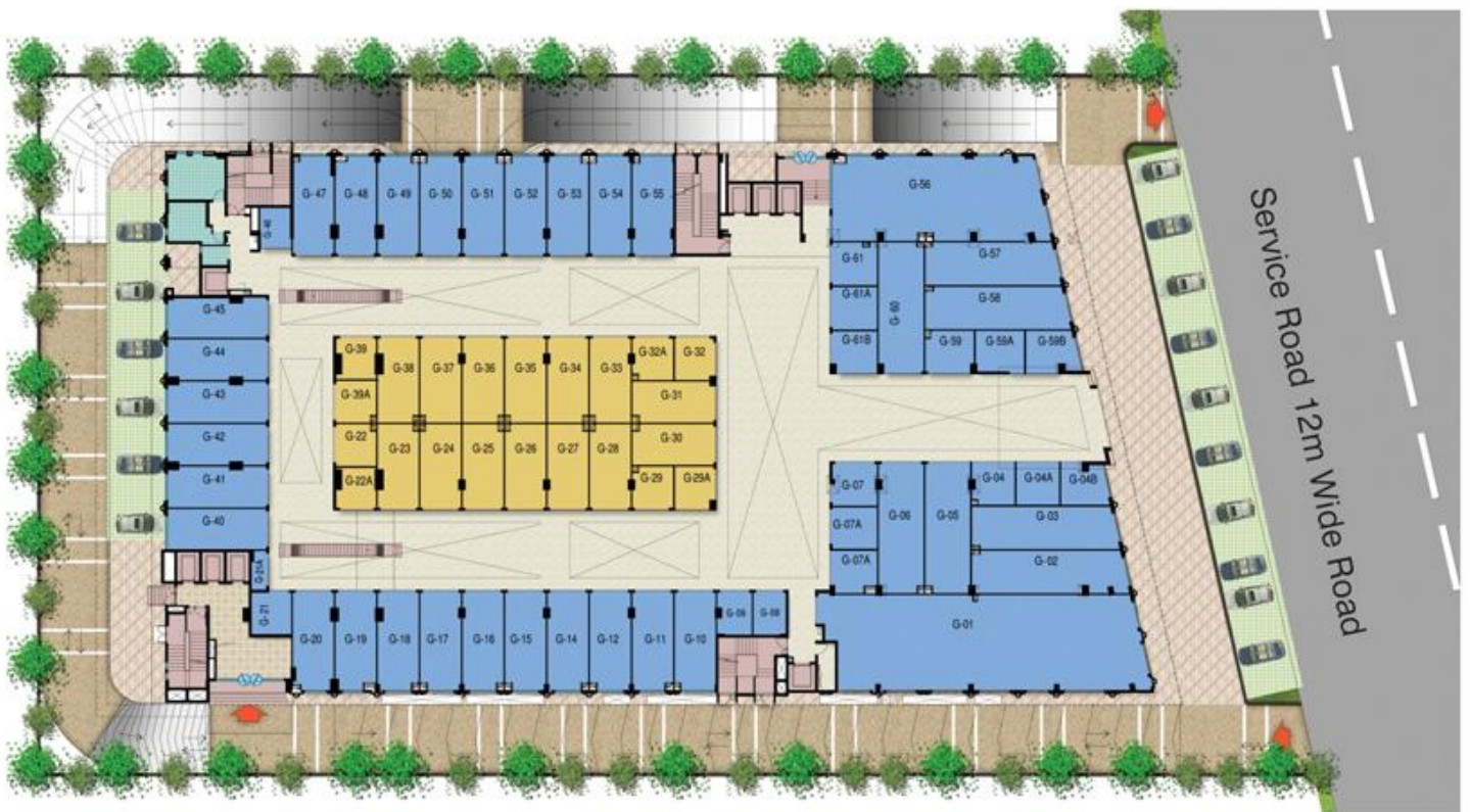
TYPE OF CONSTRUCTION